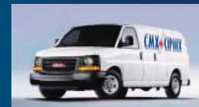
Van may not be exactly as shown.

One lucky CMX-CIPHEX show visitor will win a 2010 full size GM van, with custom racks and shelving.